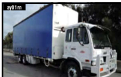
ay01rn 2007 UD PKC215 Stk# 443 Fitted with 14 pallet curtainsider w/3m side opening, new curtains/hanging gates, 6x2 drive w/airbag & height adj. fitted, fully rebuilt gbox w/warranty, 2 fuel tanks, as new tyres, excellent truck . . . $66,000