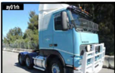
ay01rh 2001 VOLVO FH12 Prime Mover Stk# 442 460HP, hydraulics, Byool sleeper cab with A/C, alloy bullbar and spotlights $35,000