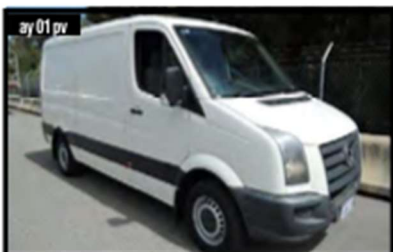
ay01pv 2010 VOLKSWAGEN CRAFTER TDI Stk# 427 6 speed manual, medium wheelbase van $14,000