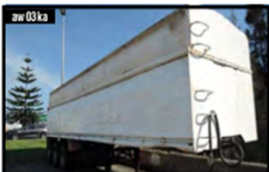
aw03ka 2008 BYLAND Tipper Trailer Stk# 384 Tri-axle semi tipper lead trailer, 9.8m long with K-hitch axes, spring suspension, and roll over tarp $47,500