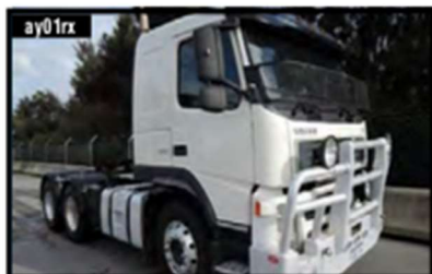
ay01rx 2007 VOLVO FM480 Stk# 435 I-Shift with hydraulics, gearbox recently rebuilt $44,000