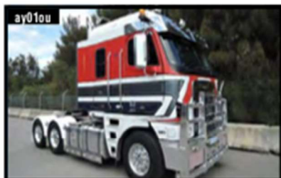
ay01ou 2010 FREIGHTLINER ARGOSY Stk# 440 Detroit Series 60, 3 pedal semi auto transmission, auto greaser, ice pack, new radiator & header tank, injectors & turbo done at 550,000kms, very well looked after! ..... $55,000

Quality Used Trucks &amp; Trailers - Call Us Today!