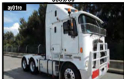
ay01re 2007 KENWORTH K104B Stk# 422 C15 CAT engine with new 18 speed Road Ranger gearbox $66,000