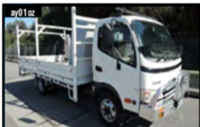
ay01oz 2009 HINO 300 Series 716 Stk# 444 Steel Ace series, 3 seater cab, 4.3m tray with 1 tonne rear mounted Kevrek Crane $24,000