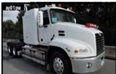
ay01pw 2003 MACK VISION 427 Stk# 429 6x4 prime mover, has hydraulics and is in great condition with 8 new drive tyres just fitted $55,000