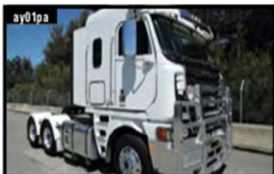
ay01pa 2011 FREIGHTLINER ARGOSY Primemover Stk# 447, very tidy truck! Cummins rebuilt 550,000kms ago, 90T rated $66,000