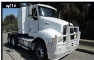
ay01rt 2007 KENWORTH T350 Auto Stk# 445 With IT bunk, 435HP CAT C12 engine, auto shift trans, alloy wheels, new steer tyres, new paint, hydraulics fitted with tank, can set up truck for any application at cost, very tidy truck . . . . $66,000