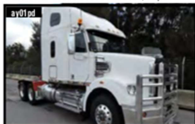
ay01pd 2011 FREIGHTLINER CORONADO Stk# 419 140T rated, new Detroit DD15 fitted, sleeper bunk with A/C, drawer fridge, near new steer/drive tyres, truck is in immaculate condition! $88,000